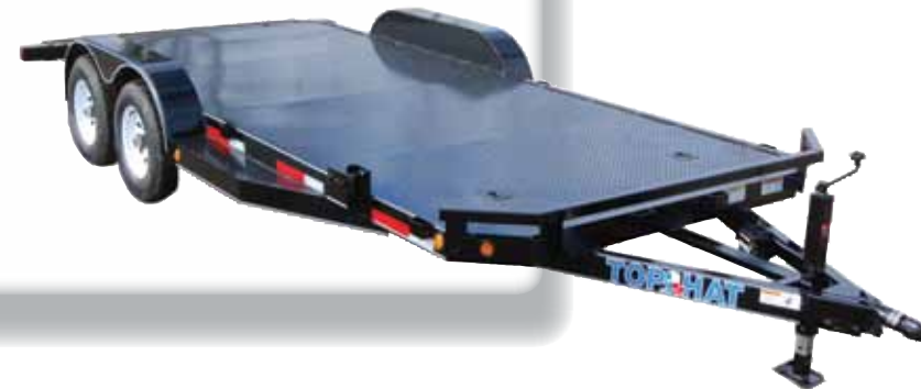
Trailers may be shown with optional equipment. Additional Options may be available.

Frame: 5" Channel Front Bump Rail: 2" Square Tube Crossmembers: 3x2x3/16 Tongue: 5" Channel Wrap Tongue Brace: 3" Channel Flat 45 Degree Front Corners Floor to Fender Ht. 10"